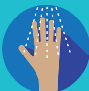
SHYIRA AMAZI KU NTOKI