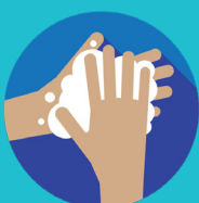
UKUBE: AMASEGONDA 20